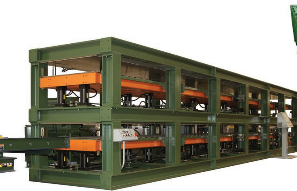
Double cavity injection discontinuous press